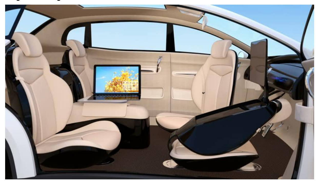
Figure 1. Image of a dedicated automated vehicle

Figure 1 shows how a dedicated automated vehicle might look. There is no steering wheel or 'driver's seat'. It illustrates the type of vehicle the NTC is describing when it refers to a dedicated automated vehicle.