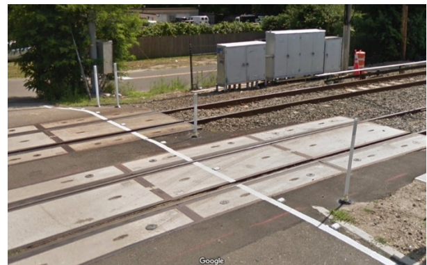
Figure 2. ROW Incursion Treatments Installed at the LIRR Crossing on Pond Road in Ronkonkoma, NY (Crossing ID 338175R)

LIRR completed the installation of the white pavement markings, reflective markers, and delineators at all of their 296 grade crossings in the summer of 2018. An example of this treatment as installed at Pond Road in Ronkonkoma, NY (Crossing ID 338175R) is shown in Figure 2 .